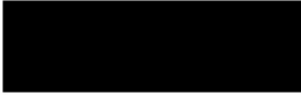
Black Solar Absorptivity 0.95 QC56068 - Gauge 26, 24

Colors subject to varying lead times. Contact Conserval for up-to-date availability and pricing.