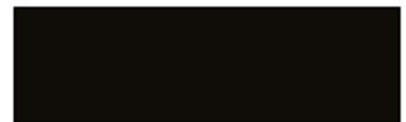
LSR Dark Brown Solar Absorptivity 0.95 QC55039 - Gauge 26 Only Limited Availability

Note: Color appearance will vary depending on monitor and/or printer calibration; before placing an order you may request a metal sample for accurate color representation